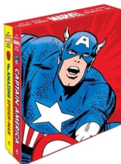
My Mighty Marvel First Book Boxed Set