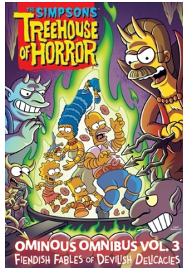
The Simpsons Treehouse of Horror Ominous Omnibus Vol. 3: Fiendish Fables of Devilish Delicacies by Matt Groening (Available only in the ABRAMS booth)