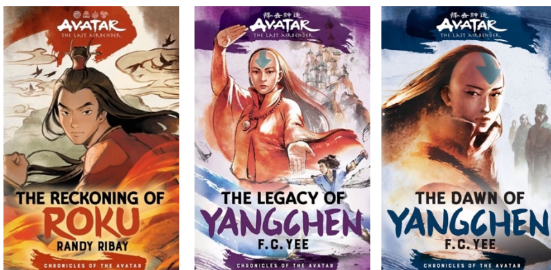
Avatar, The Last Airbender: The Reckoning of Roku (Chronicles of the Avatar #5) Features a limited edition wraparound poster jacket