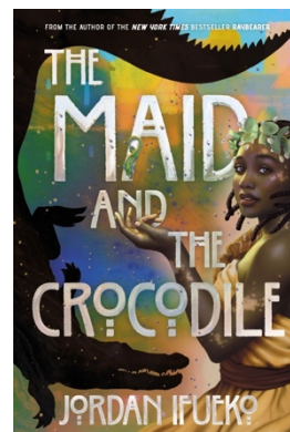
The Maid and the Crocodile: A Novel in the World of Raybearer by Jordan Ifueko Wednesday, July 24 at 5:30 PM