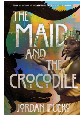
The Maid and the Crocodile: A Novel in the World of Raybearer by Jordan Ifueko (Available only in the Autographing Area)